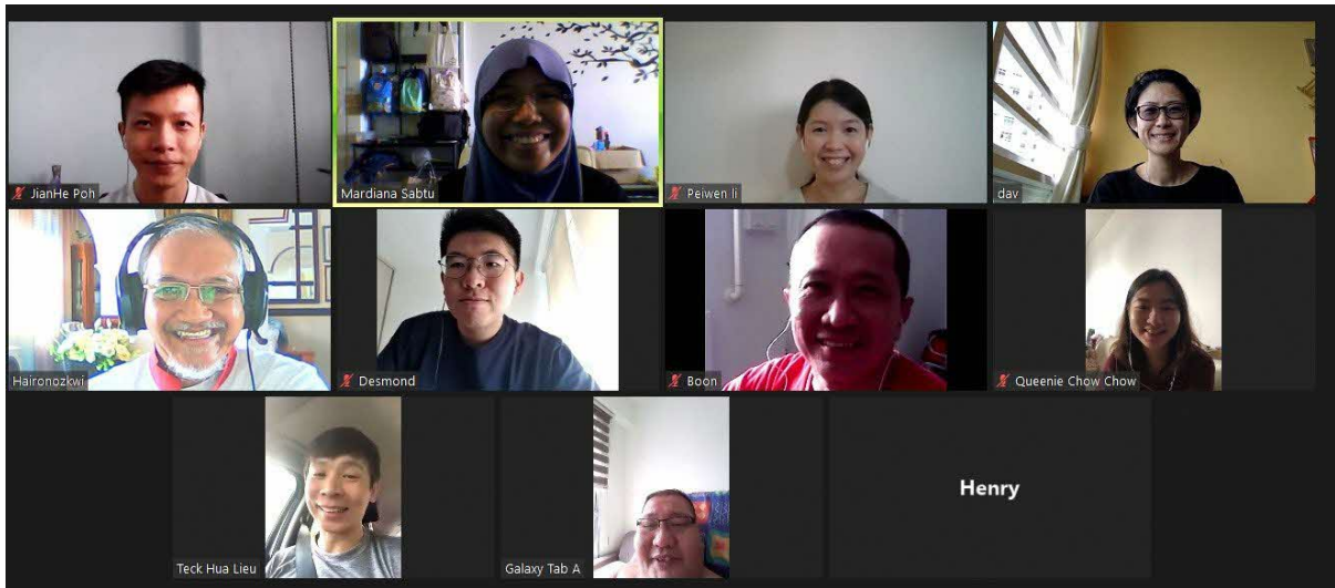
Mid year check in session with befrienders in July 2020 and discussion and training about tele-befriending via Zoom.