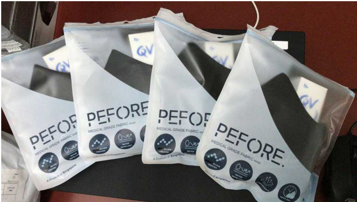
Annual care kits for befrienders issued in January 2021.